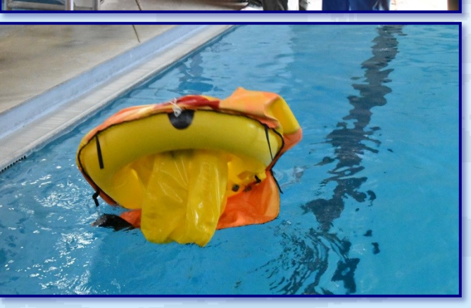
Savannah, GA